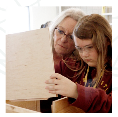
Read more on the Dura Supreme Blog!

https://www.durasupreme.com/.../kids-switch-day-dura-supreme