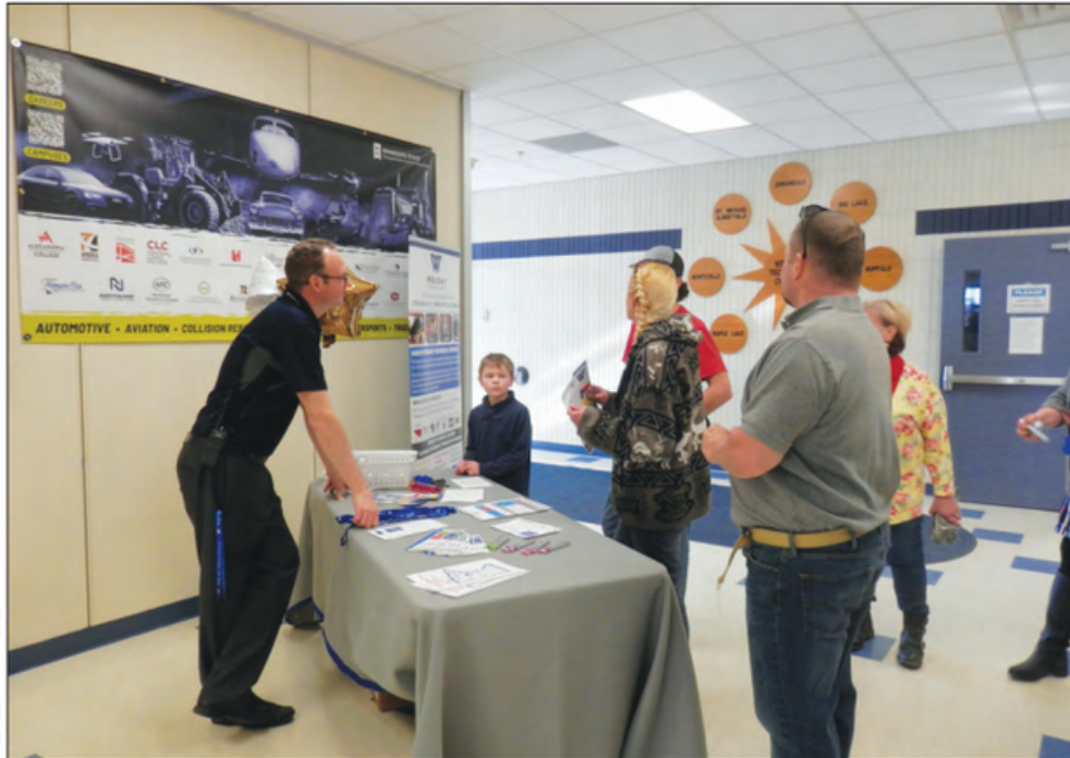
Many people visited Wright Technical Center (WTC) on Monday, April 17, for their open house in celebration of providing education to our community for 50 years. The open house was held from 4:00 to 7:00 p.m.

Wright Technical Center (WTC), located in Buffalo at 1405 3rd Avenue NE, recently celebrated serving the community for 50 years on Monday, April 17. The WTC is a cooperative public high school that provides instruction in career, technical, and alternative education. To celebrate 50 years, WTC held an open house. Tours were offered, hotdogs, hamburgers, and slices of cake were served, and there were door prizes. WTC serves eight school districts in Wright and Sherburne counties including: Annandale, Big Lake, Buffalo-Hanover-Montrose, Delano, Howard Lake-Waverly-Winsted, Maple Lake, Monticello, and St. Michael-Albertville.